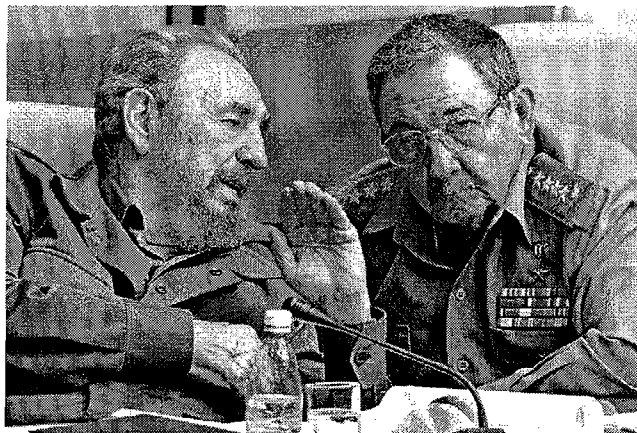
Cuban president Fidel Castro confers with his brother Raúl, then Minister of the Revolutionary Armed Forces, in December 2003.

Whom the government sought to benefit was equally newsworthy. In its most revolutionary phase, during the 1960s, the Cuban government adopted strongly egalitarian policies. Many Cubans came to believe in egalitarian values and resented the widening of inequalities in the 1990s. Consider, then, Raúl's reforms. Hotels and restaurants designed for international tourist markets are expensive; so, too, are computers and DVD players. When these economic changes were announced in 2008, the median monthly salary of Cubans amounted to about $17: that is, the average monthly salary was below the World Bank's worldwide standard for poverty, which is one dollar per day. To be sure, Cubans had free access to education and healthcare and subsidized access to some other goods and services. Nevertheless, only a small fraction of Cubans could take advantage of these new economic policies, because the